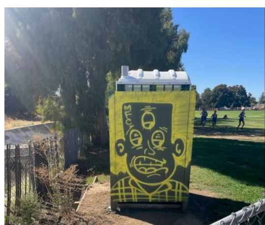
Christensen Park Enclosure

Local Livermore artists are proudly displaying their work at LARPD restroom facilities. Here we see examples at Christensen Park and May Nissen Park. Unfortunately, we had to remove the artwork due to its inappropriate nature.