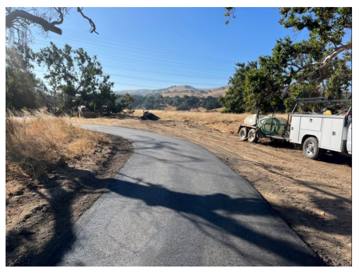
New Trail Bypass - Sycamore Grove

Asphalt debris removal from the trail within Sycamore Grove was completed last month. This Month, the 300-foot-long bypass trail was completed in 4 days with no impact to park users.