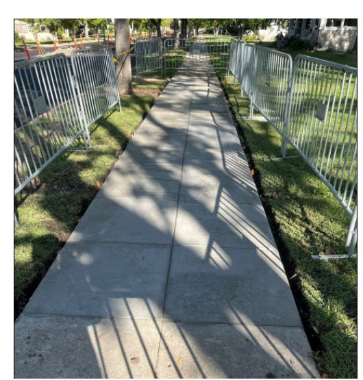
Trevarno Sidewalk- After

Some other noteworthy projects completed by the Facilities team this month: