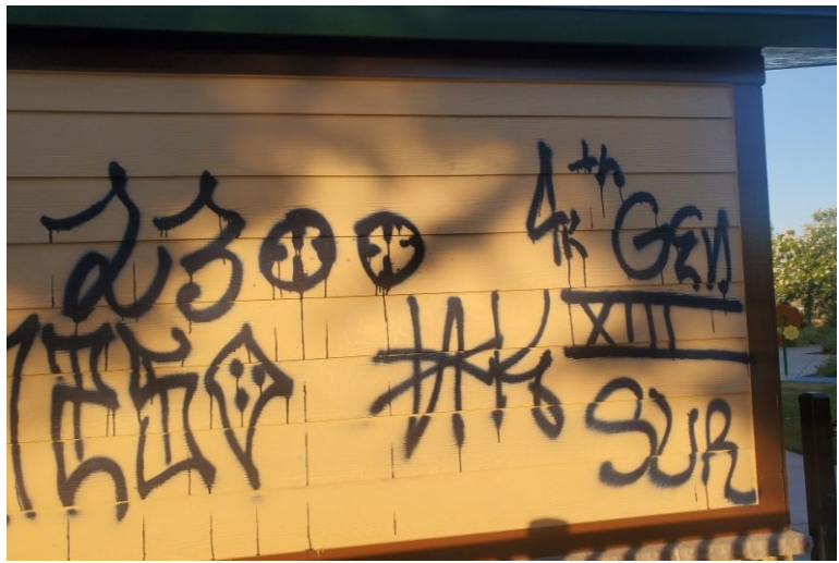
May Nissen Park Restroom

Now that the Trevarno sewer/water project is nearing completion, it is time for cleanup and improvement efforts to begin. There were several areas of lifting or damaged sidewalk in front on Litle House and the Merritt building. Many of these areas came from rerouting water and sewer lines. The Facilities team demolished and replaced several sections of concrete sidewalk to alleviate trip hazards and improve the overall appearance of the site.