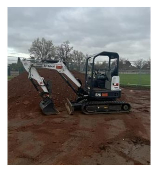
Upper Independence pruning project.