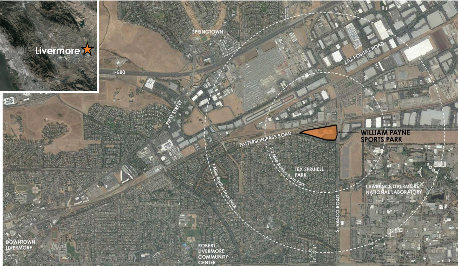
City of Livermore