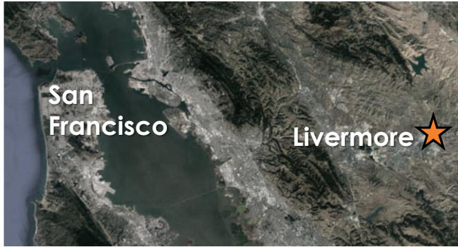
San Francisco Bay Area