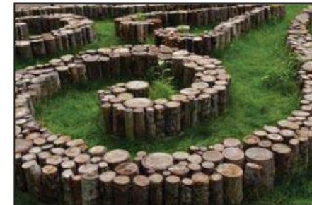
Nature Play / Site Art