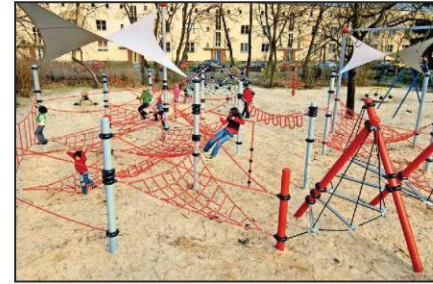
Low Ropes Course