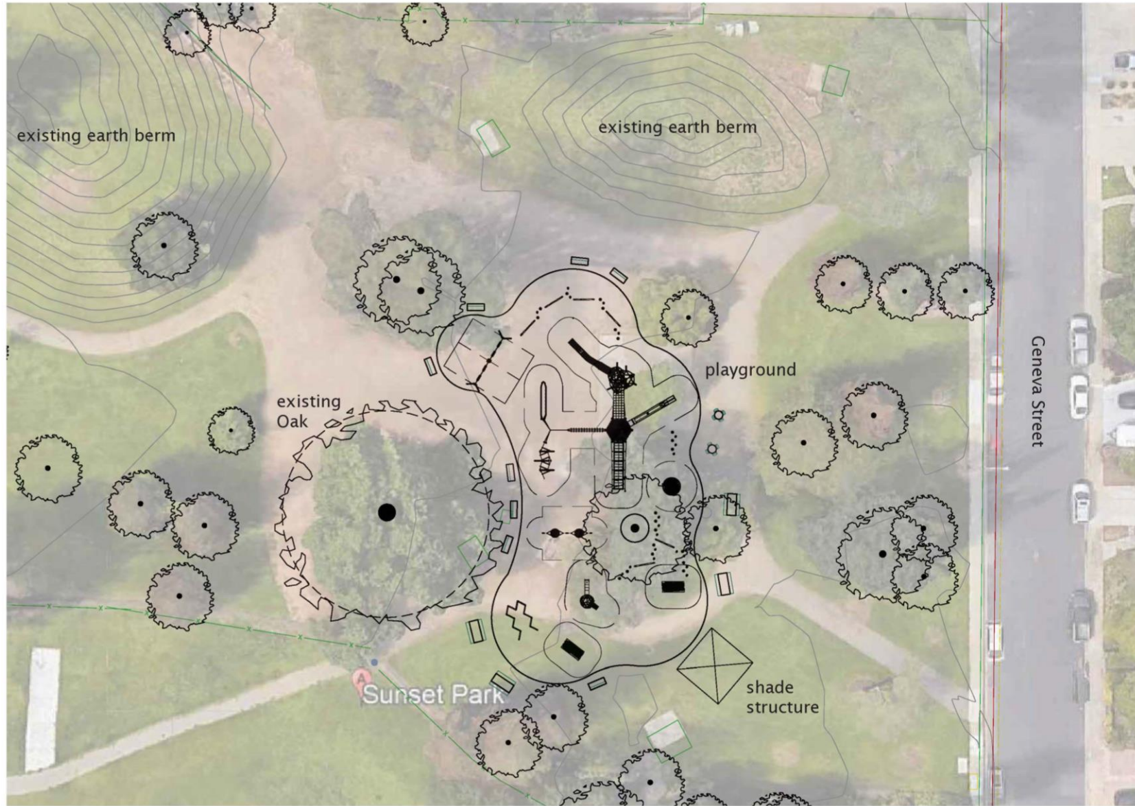
Concept Design Option 2 - Plan NTS