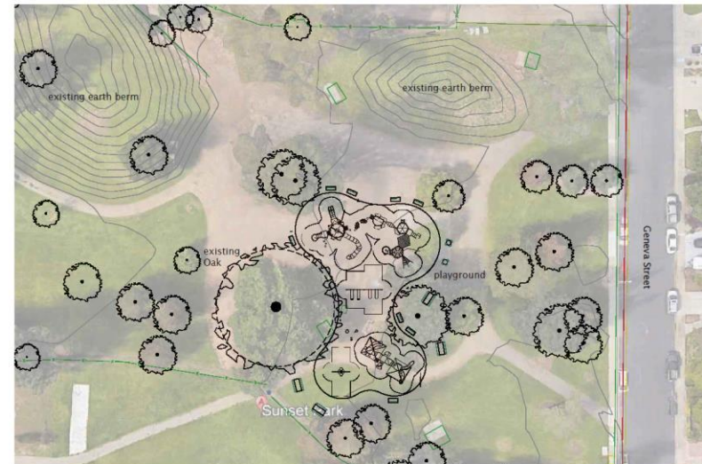
Concept Design Option 1 - Plan NTS