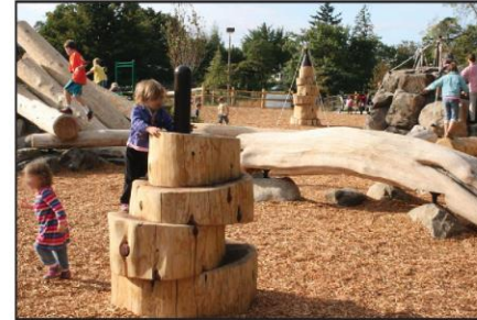
Balancing and Climbing