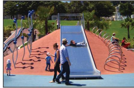
Slide Integrated into slope