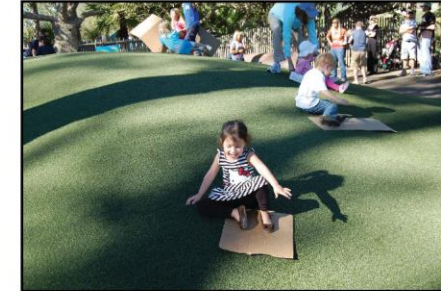
Synthetic Turf Mound for Sliding