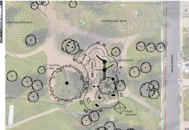
Concept Design Option 2 - Plan NTS